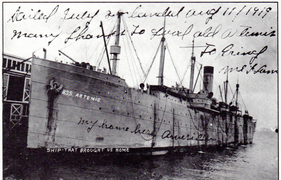
"Sailed July 2 & landed Aug 11/1919 Many thanks to good old Artemis to bring me Home."