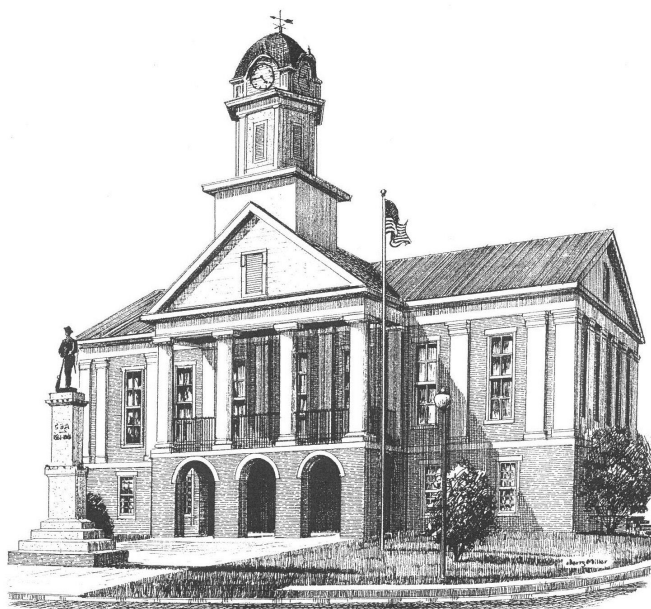
Chatham County Courthouse Savannah, South Carolina