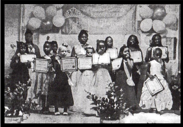
Pageant contestants... "All contestants in the recent Chatham County Fair Pageant were awarded crowns, trophies, certificates, roses, and gift bags." Chatham Record, 9 Oct 2014.

dash over. All kinds of handmade items would be on display. Hand-embroidered pillow cases, crocheted and knitted doilies for chairs, tables and anything else they could be placed on. Food, food, food would abound! Not just the luscious homegrown vegetables and fruit, and all kinds of canned goods, baked pies and cakes. This stuff was for looking at. The real food for fair goers would be outside the Exhibit Hall, hot dogs, candied apples, taffy, popcorn balls, candy, cookies, roasted peanuts in the shell and wonderful ice cream!. We never had enough money to sample all we wanted but if your buddies were true, you could get a little pinched share of many things. The Fair turned an ordinary school day into a grand holiday!