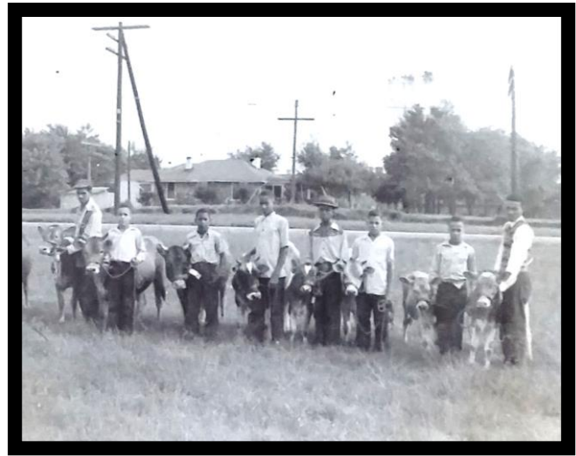
Chatham County 4-H club members show their calves at a Greensboro competition.

The first Chatham County Colored Agricultural Fair was held in 1950 on the rented grounds of the Goldston Lumber Company. Volunteers worked hard to prepare the site. A carnival was engaged – the first that many Black children had ever seen. Though plagued by mud, rain and a leaky rented tent, the event attracted about three thousand and was considered a great success. Many of the outstanding agricultural exhibits went on to good showings at the State Fair.