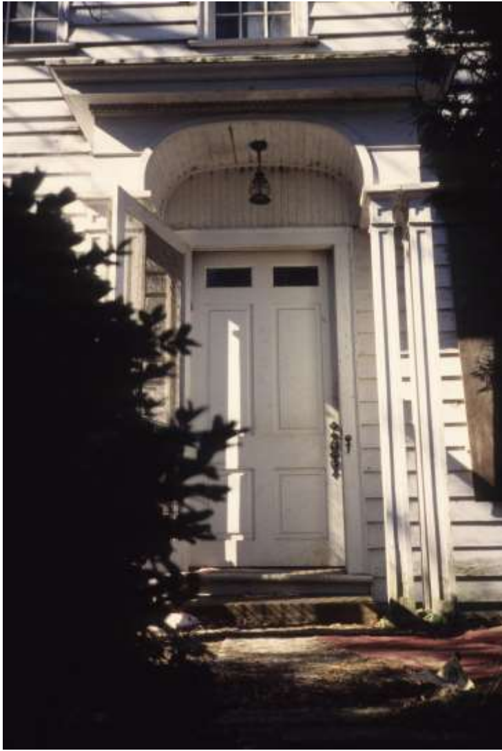
Kelvin doorway.