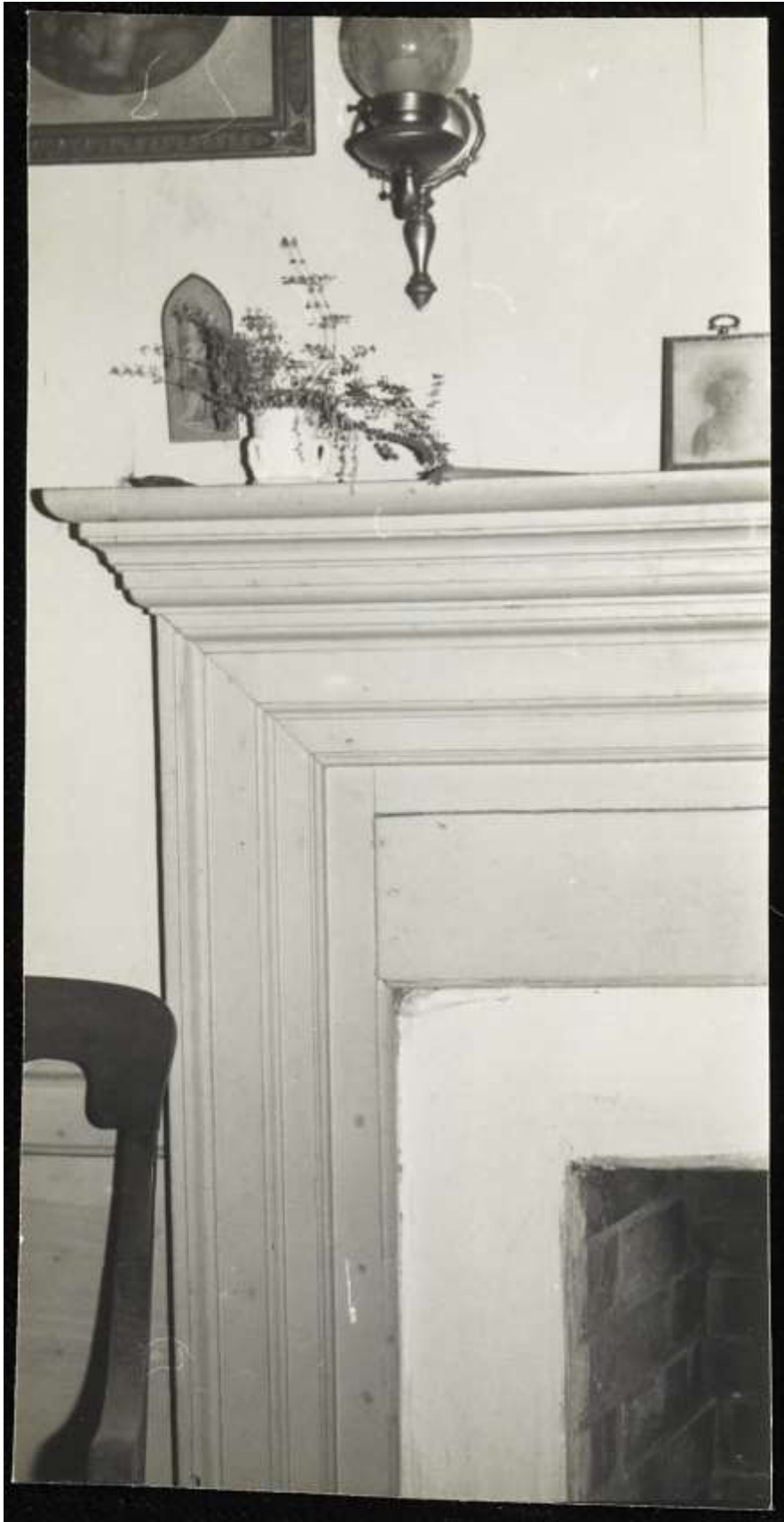
Kelvin, south room mantel detail.