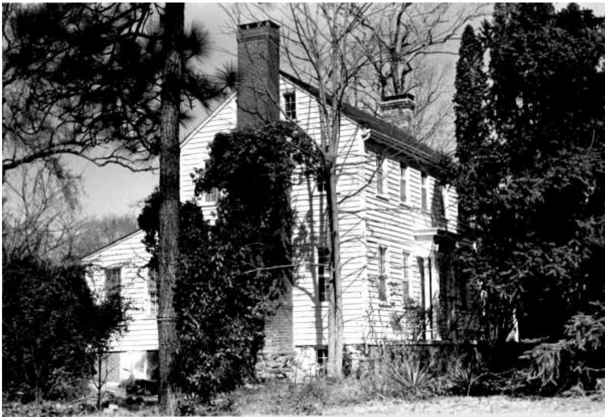
Kelvin, south end from National Register Nomination, 1982.