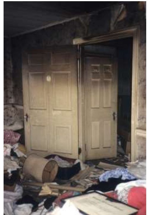
Kelvin interior doorway.