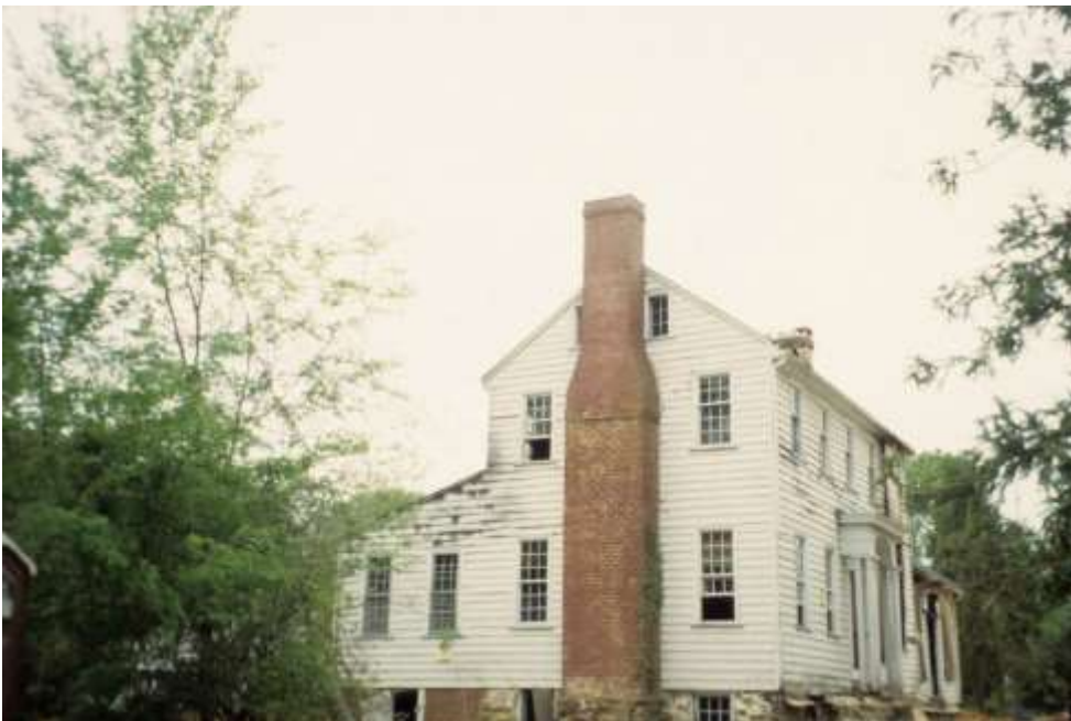
Kelvin south view.