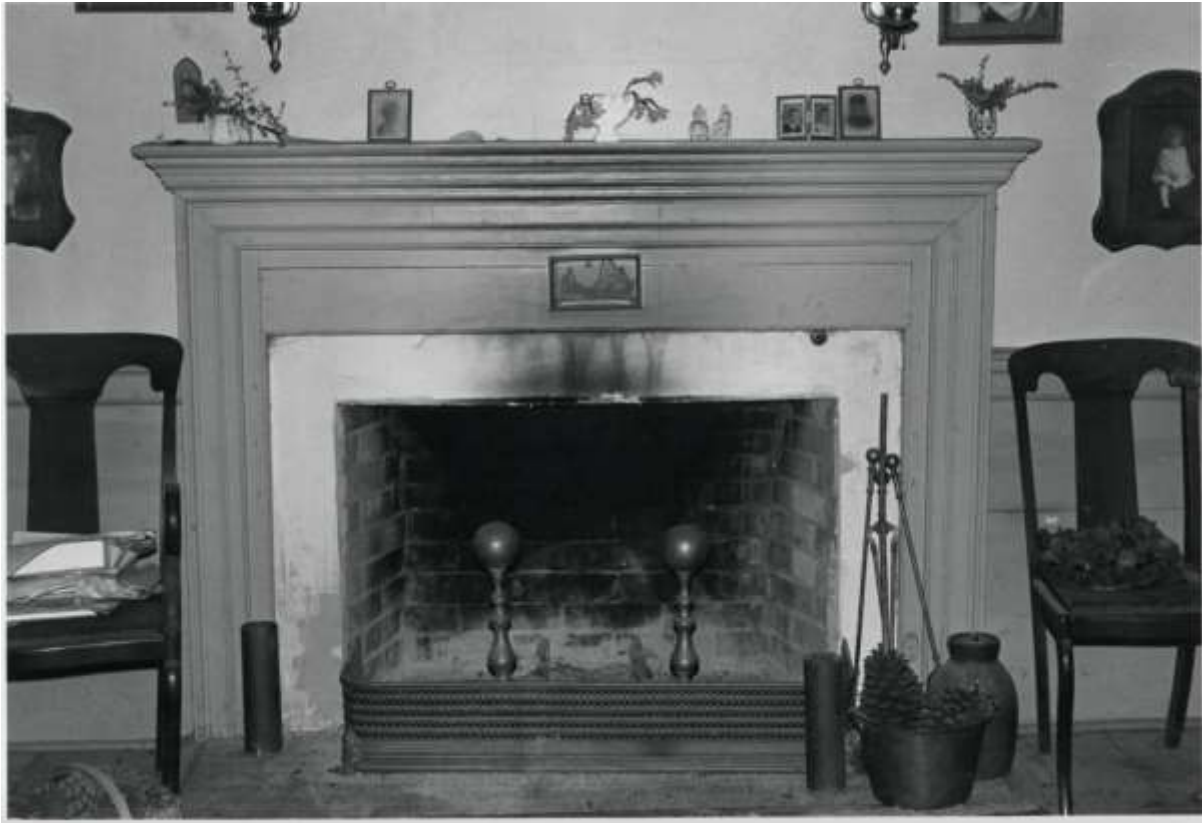
Kelvin fireplace from National Register Nomination, 1982.