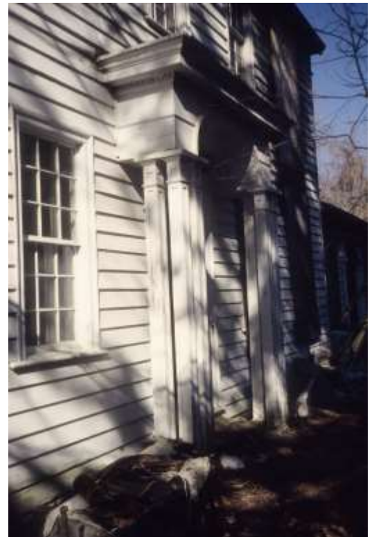
Kelvin entrance detail.