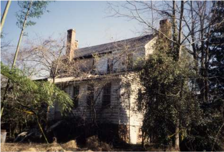
Kelvin rear view.