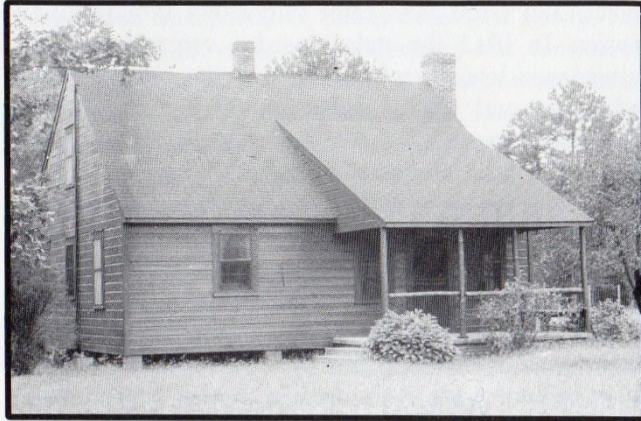
Cockman Brothers' Hickory Mountain Gun Club lodge.