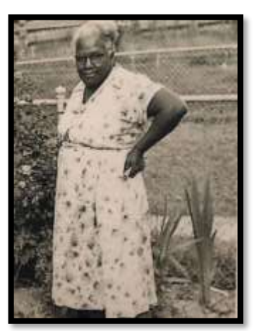
Roxie visiting DC to attend the 1961 inauguration of JFK.

Roxie died on March 9, 1965, at the age of 64, and was buried in Mitchell's Chapel AME Church cemetery, in Pittsboro.