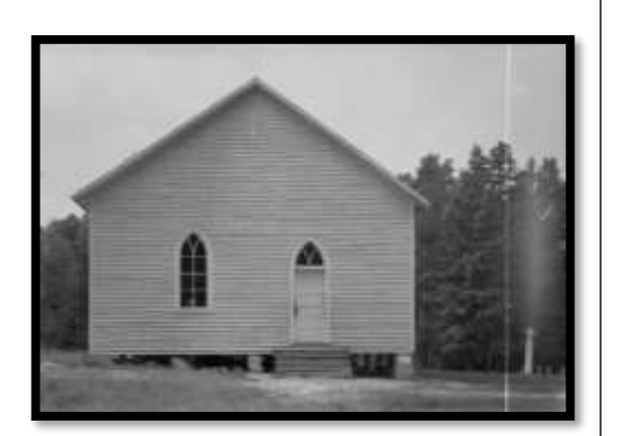
Belmont AME Zion Church, Pittsboro