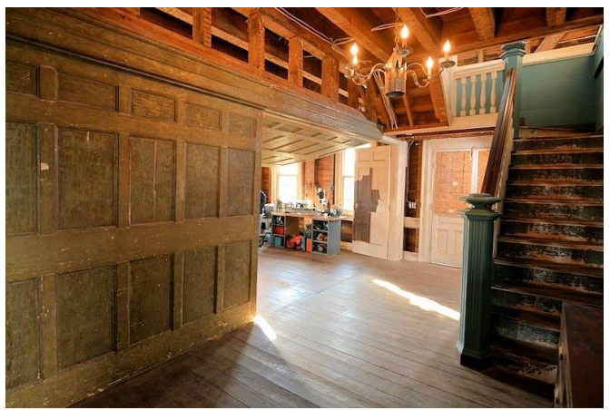
Hinged panel wall after restoration work. One panel is down and the other up in this photo.

A unique feature of the St. Lawrence house that is not mentioned in the ad is the hinged panel partition that can be raised to create a large, 27' by 27' room and provide direct access to the two parlors on the lower floor. Experts note that this is consistent with the mention of the "summer society" in St. Lawrence's ad. Such a room would have provided the local gentry--which in the case of Pittsborough consisted of well-heeled summer visitors from the east, as well as lawyers, doctors, and local planters--with a large assembly room that could be used for dances, meetings, and fine dining. The inn, placed strategically on the courthouse square, would have been a popular accommodation during court sessions when landowners, judges and lawyers traveled to town from their county estates.