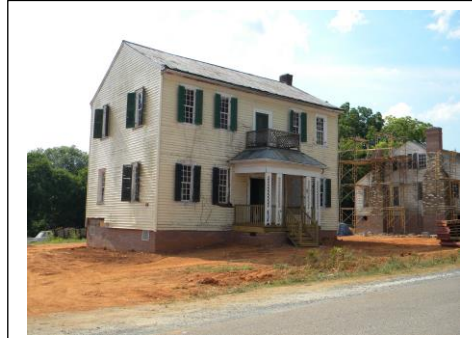
The Yellow House awaiting purchase in 2011.

The St. Lawrence House/Tavern has also profited from all new electrical and plumbing systems which have recently been installed. When the rough-in inspection is complete, the Carneys will be covering the interior walls using “blueboard” (a form of drywall that requires a coat of plaster to finish it), which will be in keeping with an old house.