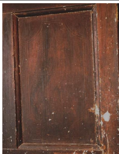
Panel detail showing faux mahogany finish on yellow pine lumber.

Not so, the Carney's discovered. When Janet Carney removed layers of paint from doors and woodwork, she discovered that the "fine, imported wood" was actually faux mahogany finish on yellow pine lumber.